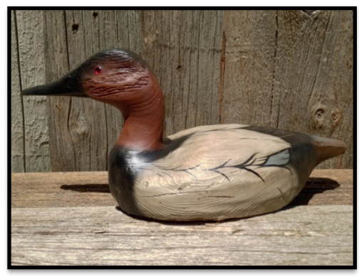
Canvas Back Drake (Veasey)

There will be multiple additional prize drawings between 12 noon and 4 pm on April 25. All raffle tickets will be included in Grand Prize drawing. Prizes for additional drawings include: