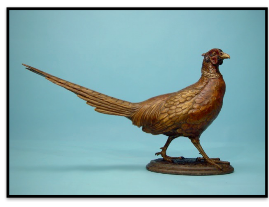
"Ring-neck Pheasant"