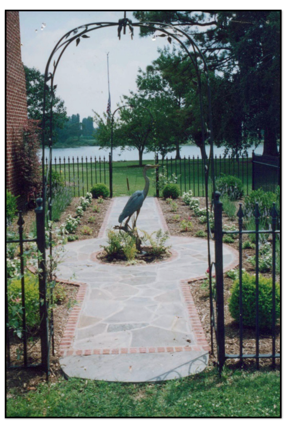
TURNER SCULPTURE: In The Garden