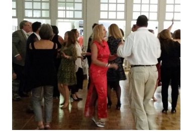
Dancing the night away